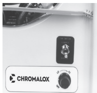
Summer Fan Switch