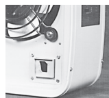
3 Pole, 600V Rating